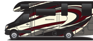
Premium Paint - Pinehurst