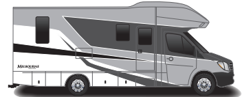
Premium Paint - Phantom