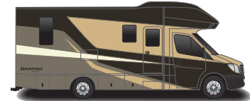
Premium Paint - Hollywood