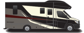
Premium Paint - Canyon