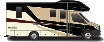
Premium Paint - Merlot