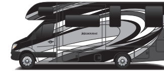
Premium Paint - Muirfield