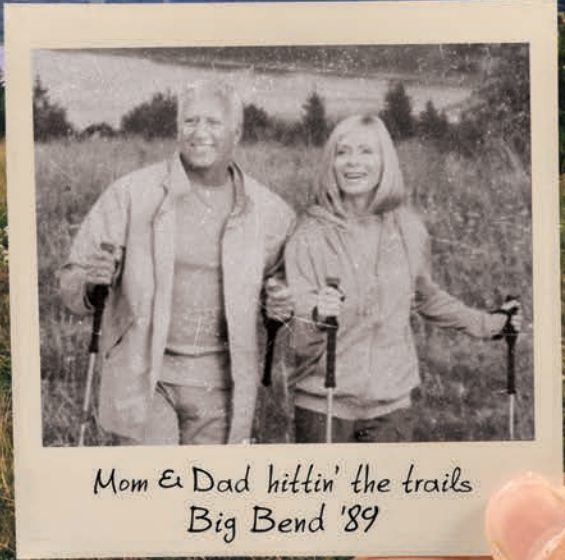
Mom & Dad hittin' the trails Big Bend '89