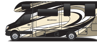
Premium Paint - Waterville